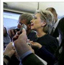
The Buzz on the Bus: Pinched, Press Steps Off

Home | World | U.S. | N.Y. / Region | Business | Technology | Science | Health | Sports | Opinion | Arts | Style | Travel | Jobs | Real Estate | Automobiles | Back to Top