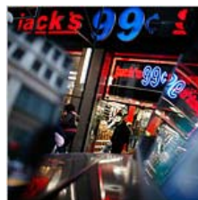
How to Survive in New York on 99 Cents