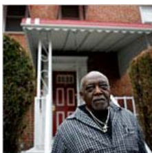
Swift Steps Help Avert Foreclosures in Baltimore