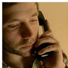
T Takes: Mark Webber